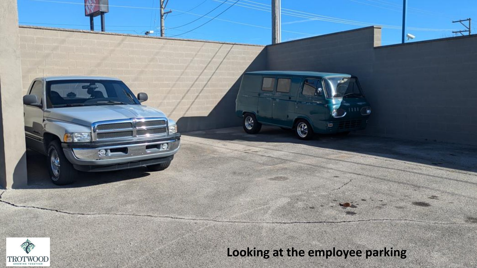
Looking at the employee parking